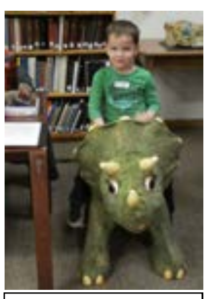
A robotic triceratops is ridden

On January 6, the Pebble Pups helped host the Family Geology Day at the Western Museum of Mining and Industry. The Pebble Pups provided many engaging activities for the kids who attended this event. This is one of the events where the Pebble Pups meet new families and recruit new kids into the CSMS and Lake George Gem and Mineral Club Pebble Pup program.