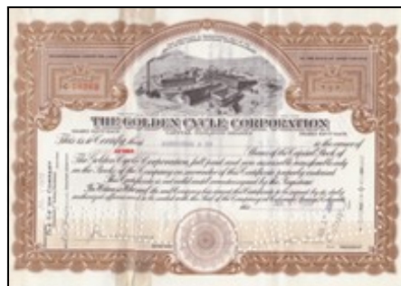
Fig. 3. Golden Cycle certificate; Cripple Creek/Victor.

Closer to home I recently found a certificate noting in 1938 the Golden Cycle Corporation of Colorado Springs sold “exactly seven shares” of their Capital Stock to Boettcher & Co. for $70 ($10 per share) ( Fig. 3 ). The Corporation originally was incorporated as the Golden Cycle Mining Company (in West Virginia, 1895), changed its name to the Golden Cycle Mining and Reduction Company (1915) and finally to The Golden Cycle Corporation (1929). Its major business was mining gold at Cripple Creek and Victor but later expanded to buying a railroad (Midland, transporting ore from the mines to Colorado Springs), building a gold mill in Colorado Springs, and mining coal from the Popes Valley/Rockrimmon area (Pikeview Mine) in north Colorado Springs for use by the mill. In the late 1940s Golden Cycle dismantled its mill in Colorado Springs and moved it to Cripple Creek/Victor where it operated until 1962—although they continued mining the soft coal here in northwest Colorado Springs