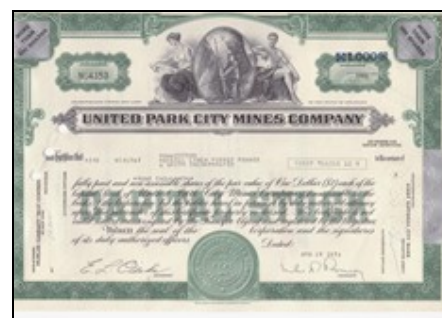
Fig. 2 United Park City (Utah) Mines cer-

During my time at the University of Utah in the late 1960s Park City was run down old mining town with many abandoned buildings, cheap real estate and the small Treasure Mountain resort. Serious skiers gravitated to the resorts in Big and Little Cottonwood Canyons adjacent to Salt Lake City. Skiers who desired a party atmosphere with more “open entertainment” rode the Snowball Express ski train from Salt Lake City to Park City and experienced “liquor by the drink” since the Federal government controlled the trains and “dry” Utah could not control their servings!