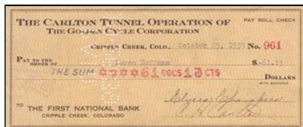
Fig. 4. Pay check issued in 1939 for work on the Carlton Tunnel (Cripple Creek/Victor).

Before the recent advent of open-pit mining, Cripple Creek Victor was the home to several hard-rock underground mines. As these mines were deepened water seepage became a major problem and therefore several drainage tunnels were constructed. The Roosevelt Tunnel was the first of these major projects and was completed in the early 1900s. It lowered the water table around some of the mines nearly 1500 feet. The Carlton Tunnel was the last of the bunch and was completed in 1941 and drained water perhaps 3000 feet