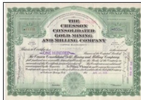
Fig. 5. Stock certificate for the Cresson Consolidated (Cripple Creek/Victor).

I am not certain about the complete history of the Cresson Company except that the original Cresson mine was not a money-maker until late 1914 when the ultra-rich Cresson Vug (~1265 feet below the surface) was discovered---a room size cavern filled with various ores, mostly sylvanite [(Au,Ag) 2 Te 4 ] and calaverite [AuTe 2 ], containing crystalline gold. In a month or so about 60,000 troy ounces of gold was taken out of the vug with hand tools---what is that, 80-90 million dollars in today's prices? The mine was still producing excellent gold in 1915 and was sold to A.E. Carlton and Associates in 1916. Carlton and his friends owned the Golden Cycle noted above, and in fact, owned about 95% of the gold properties in the Cripple Creek District. The Cresson Mine (underground) continued to produce until about 1960 when most mining in the Cripple Creek area ceased. Small scale surface mining started up in the early 1970s and the giant open pit Cripple Creek and Victor Gold Mine (AKA Cresson Mine) became established (early 1990s) on the site of the old underground Cresson Mine. As noted above, the mine is now owned and operated by Newmont Mining Corporation as a heap leach project and producing over 200,000 troy ounces of gold each year from a very low grade ore.