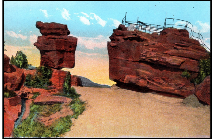
Figure 2. This view of Steamboat Rock, on a postcard, was taken about 40 years later than the image in figure 1. Few changes are noted in the physical condition of Steamboat rock. A sign read, "Steamboat Rock Observatory. Use of the telescopes free to visitors. All welcome."