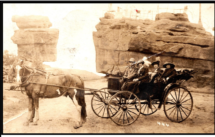
Figure 1. Early photograph of tourists visiting Balanced Rock (R) and Steamboat Rock (L). In this undated photo a man is enjoying the natural beauty of the area with three female companions in a horse-drawn buggy. Curt Goerke, a 14-year-old entrepreneur, began taking photos of tourists in front of the rocks in the 1890s, selling them each for 25 cents.

A number of the Garden of the God's landmarks, including Steamboat Rock and Balanced Rock, were shaped by erosion. Erosion continues today.