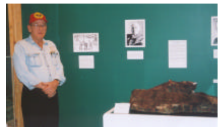
P&P Editor enjoys crystal and history wall