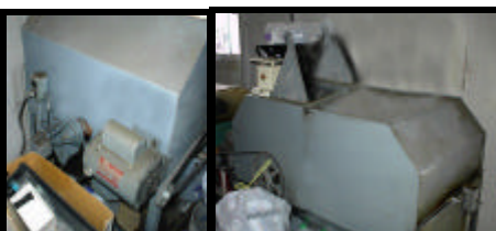
Highland Park 24" Saw Closed Cabinet with Auto Feed, on casters, good shape, no leaks—$2500 Dick's Rock Shop