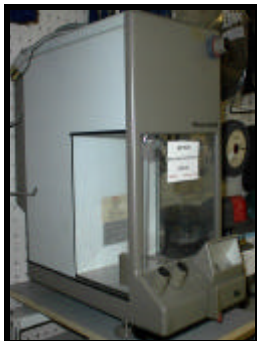
Mettler H33AR Electronic Scale 160 gal max; accurate to .0001 gal. Dick's Rock Shop

NOTICE—Items listed for sale in the Pick&Pack are displayed only as an informational service to our members and advertisers. CSMS and/or the Pick&Pack do not promote nor warranty any item displayed. The sellers and buyers are responsible for the condition and ownership of any item shown.