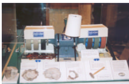
PICK & PACK