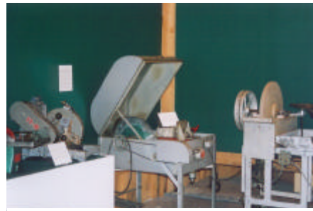
Early Equipment on Display