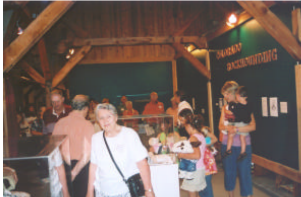
Colorado Rockhounding Exhibit Room

A big "THANK YOU" to all our CSMS members who provided items for this wonderful exhibit. Well Done!