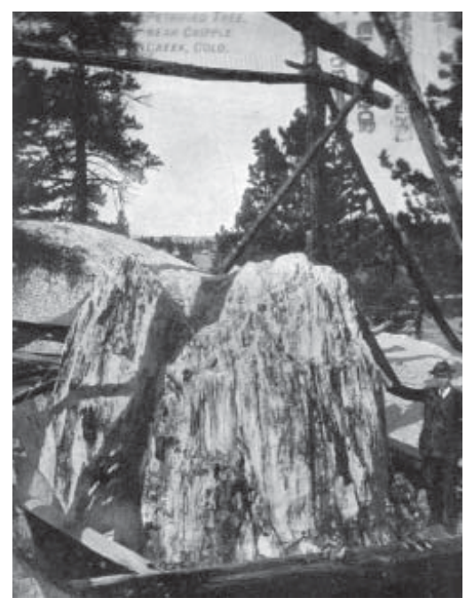
Figure 1. This postcard, ca. 1894, shows a wooden framework built around Big Stump.

Big Stump is similar to the modern Sequoia (redwood) and is the type specimen described by Andrews in 1936 for Sequoioxylon pearsallii. An often confusing aspect of paleobotany is that different or-