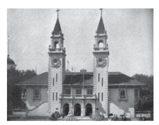
Figure 4. View of the Colorado building at the World's Columbian Exposition.

Thousands were employed in the development of 633 acres of fairgrounds and the construction of 200 buildings at Chicago's Jackson Park. Many of the fair buildings were located along constructed waterways fed by Lake Michigan. The Court of Honor buildings (14 main buildings) were covered in white stucco. Visitors, after seeing these white buildings, began to call this the White City. After three years of plan-