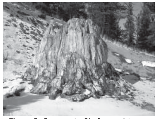
Figure 5. Fortunately, Big Stump did not make it to the White City, but remains for visitors to the Monument to enjoy. Image date 11/2003, © by S. Veatch.

Most of the states and territories had exhibits at the fair, including Colorado. The Colorado building had a wide variety of displays from the Centennial State. If