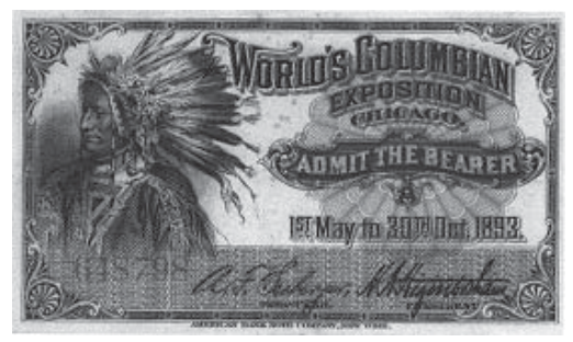
Figure 3. This ticket admitted the bearer into the World's Columbian Exposition in Chicago, a landmark event in American history and culture.