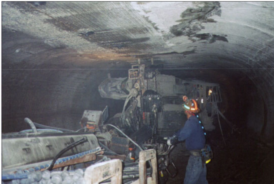
Worker at the rock bolting machine. Note the rock bolt plate in the roof-top in the left corner of the photo.

Sixteen hundred feet below the surface we got off the hoist cage and got in to two diesel-powered, customized light trucks—they had no tops—and drove seven miles through an opening about 8 feet high and