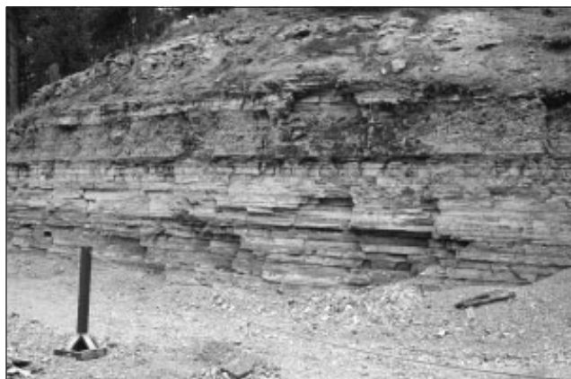
A number of remarkable fossils have come from this exposure of the Florissant Formation at the commercial quarry north of the national monument on Teller County Road 1.

an overall length of 18.5 cm; the leaf length is 15.3 cm; the stem is 3.2 cm; the width at the widest point of the leaf is 4.5 cm. The base of