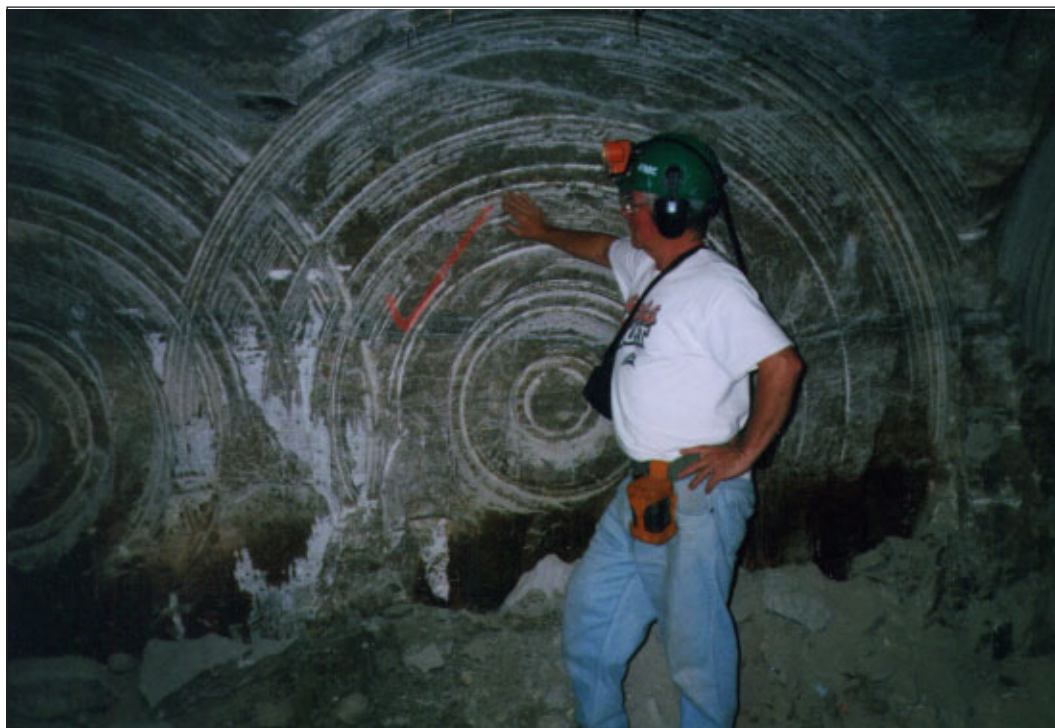
Bob King pointing out the marks left on the wall by the continuous boring machine.

as the trona is dug out by two electrically driven 75" diameter toothed rotating wheels that move parallel to the wall. Large hydraulic cylinders hold the "back"—miner's jargon for the roof of the mine. The walls are called "ribs" and the mining surface is the "face." Just think of a dog or cat lying on its stomach in a confined space. It's back