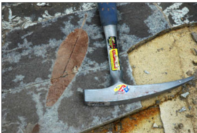
Populus crassa is one of the more common Eocene leaves in the fossil record at Florissant. This specimen is important due to the detail seen in the fossil leaf and that the fossil is largely intact.

The high school student uncovered a remarkable Eocene-age poplar leaf, Populus crassa . The fossil leaf impression, on a slab of lake shale, was formed in ancient lake sediments and volcanic ash. The lanceolate (shaped like a spear) leaf has