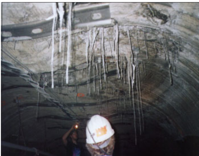
Trona Stalactites