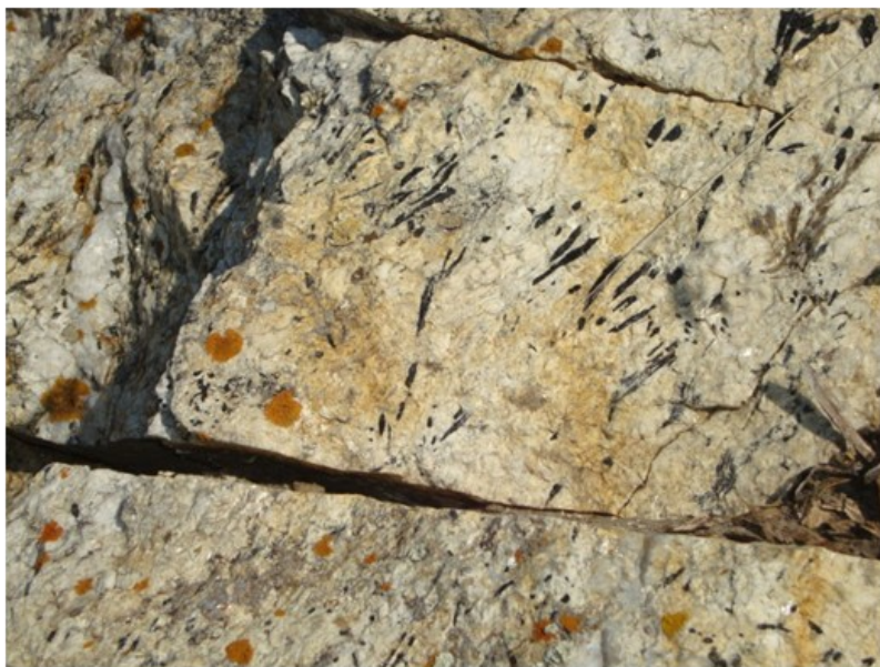
Fig. 7. Pegmatite exposed south of Custer showing tourmaline (schorl) crystals enclosed by host rock. Photo represents about six feet, top to bottom.

Another interesting specimen from the Bob Ingersoll, collected decades ago, is a large piece of muscovite with a crystal of tourmaline enclosed. This crystal does not appear 3-dimensional, but almost flattened (Fig. 11). It is tough to tell the variety of tourmaline (without taking apart the muscovite);