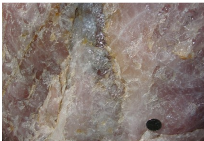
Fig. 13. Rose quartz collected near Custer