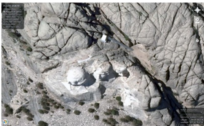
Fig. 4. Satellite image of Mt. Rushmore and Harney Peak Granite. Note intersection joint patterns in granite.

than the surrounding plains (Fig. 2). The latter is composed of an erosion-resistant Cretaceous sandstone unit termed the Lakota Formation capping the hogback with the Fall River Sandstone forming the front dip slope (away from the hills, remember the Black Hills are a large anticline or dome). Inside of the hogback is a feature known to many travelers—the Red Valley or the Racetrack (Fig. 3). This feature is a strike valley in the Permian-Triassic Spearfish Formation. That is, the redbeds of the Spearfish have eroded away between the outer (dipping away) Cretaceous hogback and the inner, massive Paleozoic Minnekahta Limestone (also dipping away). The Racetrack was an “easy” place to build railroads as well auto roads. The Spearfish Formation represents deposition of the “drying up” and receding great Paleozoic seaway. The waters became quite saline and redbeds and gypsum were left behind. Today the massive gypsum (alabaster) is quarried at several localities, and a few selenite crystals are sometimes located. It is easy to collect alabaster, especially in exposures along I-90 between Rapid City and the Wyoming state line (where the highway travels through the Racetrack).