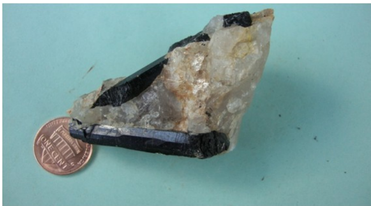
Fig. 8. Well developed tourmaline, schorl, crystals from

produced more rose quartz than any other mine in the world (Roberts and Rapp (1965).