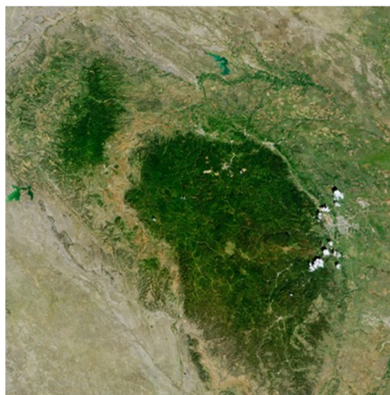
Fig. 2. Sketch map showing landforms of the Black Hills.