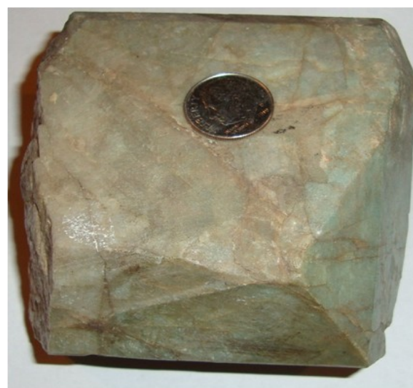
Fig. 13. Well developed crystal of microcline, var. amazonite. From Hugo Mine.