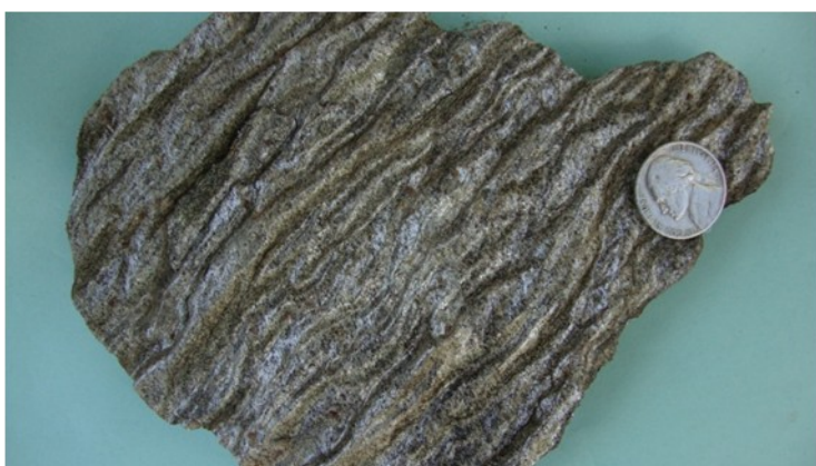
Fig. 10. Micaceous, garnetiferous schist collected near Custer.

The State Mineral of South Dakota is rose quartz, and the Black Hills of produced "millions of tons". In fact, collectors from "around the world" head to the Hills when looking for specimens (Fig. 13). The Scott Rose Quartz Mine, southeast of Custer, has