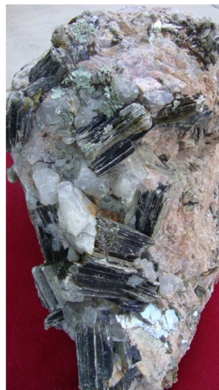
Fig. 9. Books of biotite collected from near Custer.

of the most common minerals very few of the specimens are such as collected in the local have a very nice crystal (Fig. believe, the Hugo Mine (very Keystone. During and imme-