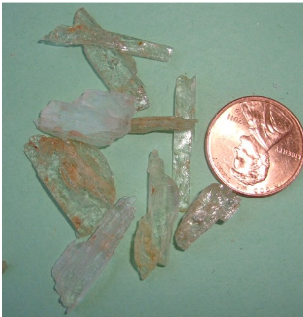
Fig. 6. Gemmy spodumene with pale pink kunzite and two fragments that are clear.

Between miles six and seven on US 16 are fantastic exposures of a wavy, shimmering micaceous schist along the west side of the road (Fig. 10). At the seven mile mark and west along FDR 287, the schist produces "gemmy, transparent, ruby-red modified dodecahedral crystals of almandite [almandine garnets]" (Roberts and Rapp,