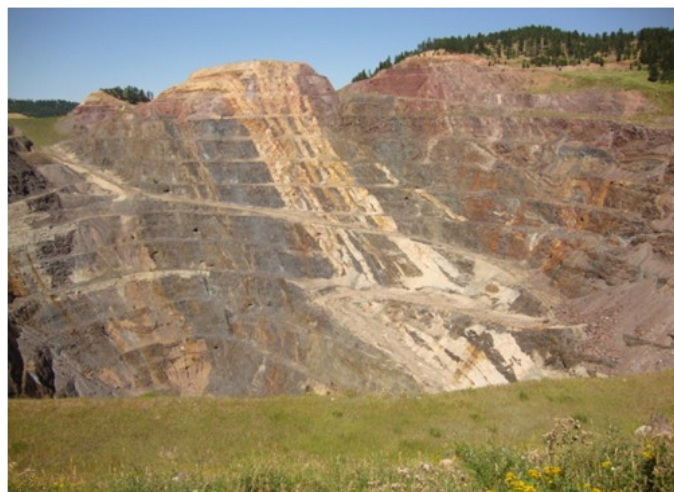
Fig. 5. The Homestake Mine open cut at Lead. Precambrian rocks (dark) are cut by Tertiary rhyolite dikes (light).

The Central Black Hills, the high peaks, have several different Precambrian units exposed with dates on the major terranes as follows (Gosselin and others, 1988; Hark, 2009): the Little Elk and Bear Mountain Terranes ~2.5 Ga (Archean) and are part of the Wyoming Craton (see December Pick & Pack); the Little Elk also has some radiometric dates of ~1.85 Ga (Proterozoic) associated with the Trans-Hudson orogenic event; the Boxelder Creek metaconglomerate with a date of ~2.5 Ga has detrital zircon dates of up to ~3.37 Ga (indicating the zircons came from older rocks); the Bogus Jim intrusive rocks with a date of around 2.0 Ga and represents is a maximum age for the Homestake gold; and the Harney Peak Granite is ~1.7 Ga.