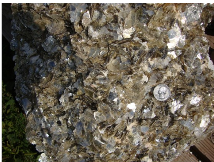
Fig. 12. Small boulder of pegmatite almost completely compose of muscovite. From near Custer.