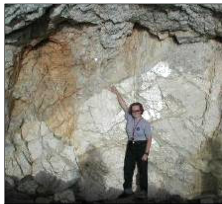
Fig. 5. Giant feldspar crystal (orthoclase) exposed at the Bob Ingersoll Mine.

for directions). The best place to prospect is on lands listed as Buffalo Gap National Grassland. Fairburns have been hunted for decades, and it takes much walking in the beds to locate an agate. You might have company since I observed Fairburns for sale in the rock shops that exceeded $1000 in cost. In addition to Fairburns, you are more likely to pick up Prairie Agates, chalcedony and Jasper, all rather pretty in their own right. Prairie Agates are non-fortification types with variable banding and colors. The most desired chalcedony is blue in color and probably originated in the Chadron Formation (the Badlands) as veins. One time common,