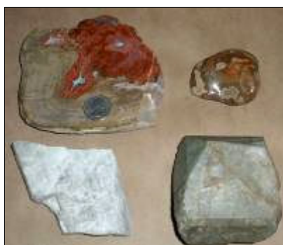
Fig. 3. Upper row, Teepee Agate slab with Fairburn nodule. Lower row, spodumene on left with microcline crystal on right. Note quarter for scale.

Besides the gold and silver, the Hills have produced a variety of other minerals with the most interesting being those from the pegmatites located in the Precambrian rocks: beryl, biotite, cassiterite, columbite/tantalite, lepidolite, muscovite, various feldspars, quartz (especially rose quartz), spodumene, talc, and wolframite. The Hills may have the one of the largest concentrations of rose quartz known, and mining remains active. The feldspar industry is particularly active near Custer, but most other industrial mineral mines are closed and generally off limits to collectors.