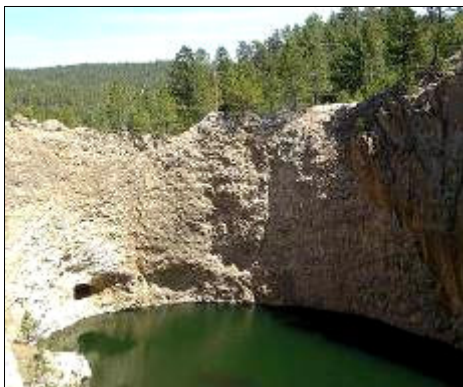
Fig. 1. View of the Etta Mine.

I have had the opportunity in the last few months to spend time in the Black Hills and surrounding areas of South Dakota. The Hills, as they are affectingly known within the State, remain one of my favorite localities since I "discovered them" on a field trip way back in 1965. Although this early trip was designed to collect mammals, I spent much time looking at the rocks, picking up minerals, and trying to determine when and how I could return. Since those youthful days I have returned and collected and hiked and fished many times.