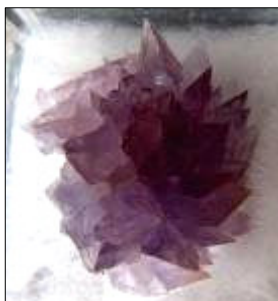
Fig. 2. Creedite from the Cresson open pit, 1.3 cm across. C.R. Carnein Collection

Attractive specimens of these and other minerals can be seen in museums and private collections, although native gold specimens of collector interest are very scarce. Other specimen-grade minerals include