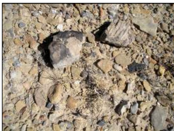
Fig. 3. Petrified wood and cryptocrystalline quartz, Chinle Formation.

Finally, virtually everywhere the Chinle Formation (late Triassic) crops out near Moab (and all over the Colorado Plateau); collectors have a good chance of finding petrified wood. Most of the wood near Moab is not a really "good wood" for polishing large slabs. Some seems okay for tumbling while other pieces show great structure and make nice shelf specimens (Fig. 3).