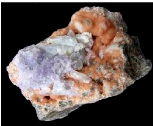
Fig. 1. A beautiful specimen of rhodochrosite (botryoidal), celestine, and creedite from the Cresson open pit, 6 cm x 3.5 cm. C.R. Carnein Collection.

More than 120 minerals have been reported from the ores and host rocks of the district (Carnein and Bartos, 2005), of which a small number are of economic or collector interest. The major historical ore minerals are calaverite,