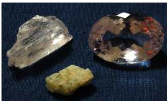
Fig. 4. Spodumene gemstones: colorless triphane, a faceted pale pink kunzite, and greenish hiddenite.

I collected a small piece of spodumene at the Etta since it had a nice green sheen to it and then promptly forgot about it for several decades (Fig. 3). In thinking about this article, I brought out the specimen and still liked it! Wondering about the green color I was sort of amazed to learn that spodumene is the source of three gemstones—kunzite, hiddenite, and triphane. Kunzite is pink to lilac in color due to small amounts of manganese. Hiddenite, perhaps best known from the mines in NC, is the emerald green variety and is quite rare. Triphane, the colorless to pale yellow variety, receives any color from iron and