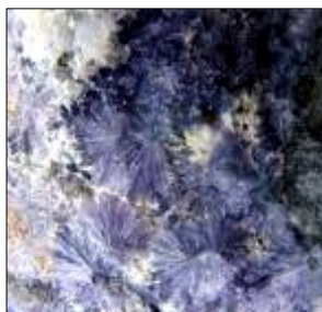
Fig. 3. Acicular, radiating sprays of creedite, 3.5 cm across, C.R. Carnein Collection

Aside from the recent Cresson finds, poor records were kept with most historical specimens, and locality information for fine specimens was often fabricated. As a result, and because the geochemistry and mineralogy of the productive zones were relatively uniform across the district (Jensen, 2003), one cannot readily identify minerals that are unique to the Victor area.