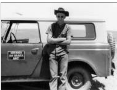
Fig. 6. Collecting agates in western, SD 1966.