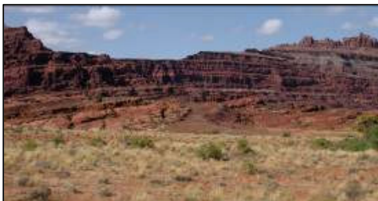
Fig. 2. Collecting locality, and there are many similar localities, along Kane Creek Road. Examine the open areas in near foreground for specimens.

South of the River is a road known as the Kane Creek Road leading out from the town to Kane Springs and the Lockhart Basin. I suggest a high clearance vehicle for the road passes over Hurrah Pass. After about 12 miles the countryside opens up, and prospectors may search the areas along the road for nice translucent pieces of chalcedony and some banded material called agate; however, the latter material is more of an opaque flint/chert with inclusions (Fig. 2). I also found concentrations of chalcedony