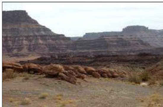
Fig. 1. Collecting locality for cryptocrystalline quartz along the "potash road" near Moab, UT. The specimens are common in the near foreground.

follows along the north side of Colorado River and is a beautiful drive. After about 10 miles, there are a number of pull offs with great views of the river (Fig. 1). These areas have a thin veneer of gravel, and rockhounders should be able to gather a