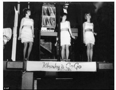
Fig. 3. I never made it to the Whiskey a Go Go in Los Angeles although star singer Johnny Rivers was one of my favorites. Here the Go Go Dancers perform the Watusi in a cage suspended from the ceiling.

On the social scene discotheques appeared, even a few popped up in Salt Lake City, where young ladies danced in suspended cages. Say it ain't true dad. Yep, I hate to say it, but your mother and I actually observed this sort of behavior while rocking to Grace Slick and Jefferson Airplane belting out Somebody to Love and White Rabbit . But don't worry son, we did not tie dye our tee shirts! And very seldom did we visit an actual establishment that served alcoholic beverages and provided a live band since our personal income was rather low! That fact was not lost on my fellow grad students and we were all in the same boat. So, it was three quarts of beer for a buck and a gallon of cheap red wine to accompany our spaghetti dinners.