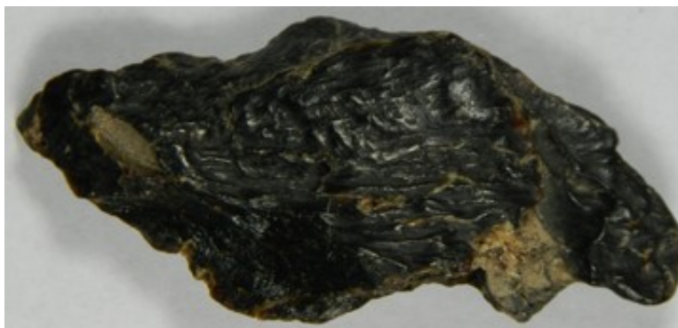
Fig. 6. Ozokerite collected near Colton, Utah. Note the shiny surface that creates a “slick” feel. Length is ~7.0 cm.

Ozokerite in the Colton/Soldier Summit area is generally black to brown-black in color often with inclusions of yellow-green resinous material (pure ozokerite from several European localities is colorless). It does not bend but seems malleable; at times the material has a petroliferous odor. It is soft and can be scratched with a finger nail, cut with a knife and has a “greasy feel.” The hydrogen/carbon ration is about 85/15 and ozokerite has a very low specific gravity of around 0.8-0.9 (water is 1.0). The melting point of ozokerite is low as it begins to melt at ~136 degrees. This low melting point allowed the early miners to boil the mine-run ozokerite in water and skim it off the surface to help eliminate the impurities.