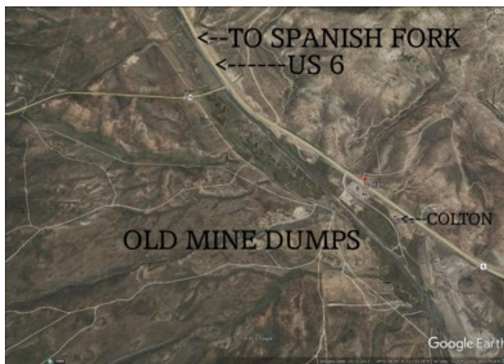
Fig. 5. image of the Colton area. Soldier Summit is just to the north of the upper border along US 6 leading to Spanish Fork/Provo. Price is to the south on US 6. Consult a road map of Utah.

Taft and Smith (1905) further noted that the distilling location consisted of a steam boiler and engine, a crusher, and steam-heated vats with narrow bottoms. The host rock and the ozokerite were crushed and run into the long vats containing water at boiling temperatures. The ozokerite begins