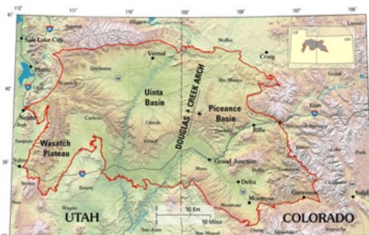
Fig. 7. Map showing location of Uinta and Piceance Basins. Daniels Canyon Summit is located in the far northwest corner of the Basin.

Hunt (1963) grouped the major bitumens of Utah (essentially the Uinta Basin) as oil shales, vein deposits, and bituminous sandstones and each group occurs in specific sedimentary facies associated with the Tertiary Green River Formation. The Green River rocks are lacustrine (lake), shoreline, fluvial (stream) deposits associated with intermontane basins in Utah (Uinta), Colorado (Piceance), and Wyoming (Greater Green River). The widespread oil shales are found in the lake rocks while the bituminous vein deposits (including ozokerite) are associated with fracture systems in the shore facies. Rocks of the subaerial facies seem devoid of bitumens. Hunt (1963) further believed these solid bitumens started as heavy oils and migrated along fault zones, or migrated updip, from the lacustrine facies into the shoreline facies. He pointed out that some wells in the Basin produce oil from fractured bituminous shale in the Green River Formation and the “heavy fraction” is similar in composi-