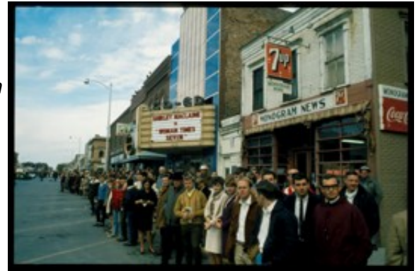
Fig. 2. Getting ready for USD 1967 Homecoming parade, downtown Vermilion. Yes, I had a collection of narrow ties.

The year 1967 was monumental for me---no I did not participate in the Summer of Love; however, in a space of two weeks I graduated with my M.A. from the University of South Dakota, drove to Kansas and married (spouse still with me), and then drove to Salt Lake City ( And I'm bound to keep on riding, and I've got one more silver dollar ---Allman Bros Band) where I started doctoral work at the University of Utah. As I tell my children (and anyone else who will listen), it was an interesting time in our nation, and the world. Nearly a half million people were serving our country in Southeast Asia and several were my friends, some of whom did not return alive.