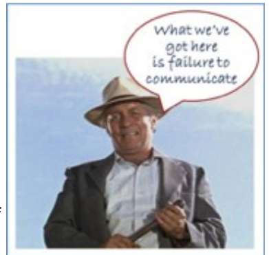
Fig. 1. Communication skills seemed lacking.