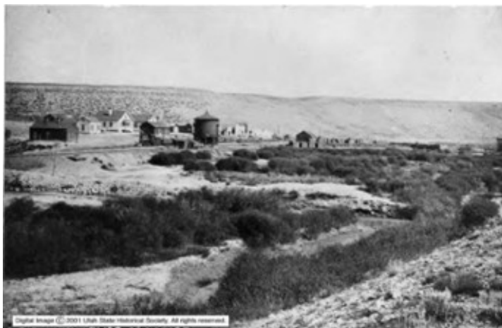
Either Colton or Pleasant Valley Junction during the heyday of wax mining.