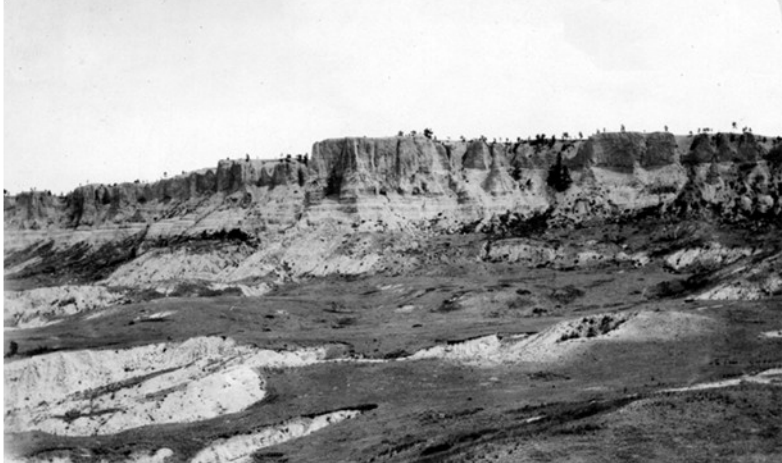
Fig. 6. South face of Slim Buttes. Arikaree cliff face with White River Group below. Photo courtesy of USGS; taken in 1911.

The Fox Hills, a unit that is also present around Colorado Springs, grades upward from the marine shales of the Pierre into marine and then into marine and brackish water sandstones. The unit represents the end of the great Western Interior Seaway and rocks are essentially shoreline deposits of the receding waters. Although the Fox Hills near Colorado Springs contains a few fossils, mostly small clams, there are parts of the formation in north-central South Dakota that are extremely fossiliferous. Some con-