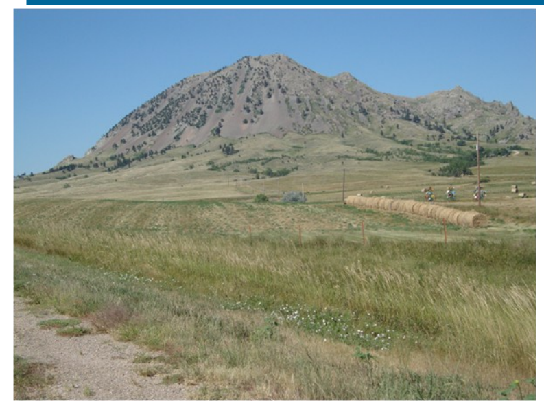
Fig. 1. Bear Butte near Sturgis, South Dakota, is a laccolith.

Most of the Butte is composed of the igneous rock; however, on the east side there is a vertical bed of Minnesula Sandstone and tilted beds of Madison Limestone (Mississippian). These are remnants of older rocks pushed up by the intrusion (Fig. 2).