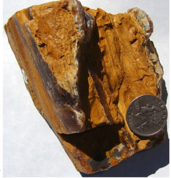
Fig. 9. Petrified wood collected (Summer 1967) from gravel pits along the White River.

There are several localities along US 18 in Gregory County (southcentral South Dakota) where gravel