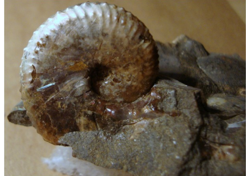
Fig. 7. Discoscaphites collected from a concretion in the Fox Hills Formation. Width is 2.5 cm.

SD 50 is a very good example of a Blue Highway where one travels through a couple of "ghost towns" (Bijou Hills and Academy), through a gap in an interesting range of hills (Bijou Hills), and past a large prairie "blowout" in South Dakota (Red lake). SD 50 heads north from near Platte (Gregory County) and ends, for this discussion, at Pukwana (Brule County; exit 272 on I-90). The anomalous Bijou Hills, including the Iona