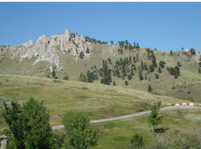
Fig. 2. Tilted beds of Madison Limestone along flank of Bear Butte.

At Newell, US 212 trends northeast toward the town of Mud Butte. This is an interesting side trip if the traveler is interested in observing Teepee Buttes. These small (~25 feet in height) cone-shaped structures were formed around methane seeps in the Cretaceous (Pierre Shale) ocean. Today they are composed of limestone and shale and many contain numerous fossils, especially mollusks, and in particular the clam Nymphalucina occidentalis. The structures are similar/identical to the Teepee Buttes found south of Colorado Springs (see Shapiro and Fricke for a great paper: Tepee Buttes: Fossilized Methane-seep Ecosystems). At one time I had a "box" of specimens (mostly clams) collected from South Dakota Teepee Buttes; however, with time they have "disappeared".