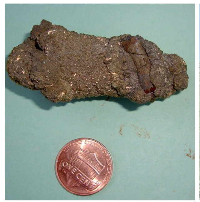
Fig. 3. Pyrite nodule encasing a small baculite cephalopod.

Continuing north on SD 79 the traveler comes to an intersection with US 212 south of the town of Newell. Take a side trip to the west on US 212 and visit Belle Fouche Reservoir (Orman Lake). Exposures surrounding the lake are dark black fissile shale (pretty ugly) of the Cretaceous Belle Fouche Shale. Streaked with thin beds of gypsum, the shale also yields pyritized nodules containing baculite cephalopods (Fig. 3). At low water levels the overlying Greenhorn Limestone produces numerous "shark's teeth". In the 1960's I was able to collect several tens of teeth; however, the years and house moves (along with donations to aspiring paleontologists) depleted the collection except for a Ptychodus , a shell crushing shark (Fig. 4). Local collectors even call one of the thin limestone layers, the shark tooth layer.