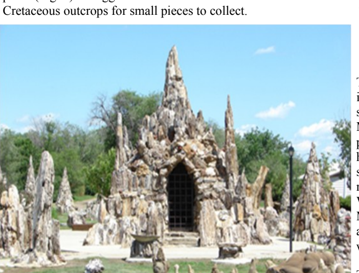
Fig. 8. The "Castle" section of Petrified Wood Park, Lemon, South Dakota.

I have collected wood all along SD 20 in the western part of the state but perhaps the most spectacular exhibit is at the small town of Lemon (north of SD 20). Here tons of petrified wood have been hauled in to construct the "world's largest petrified wood park" (Fig. 8). I suggest travelers look in road ditches in areas of Cretaceous outcrops for small pieces to collect.